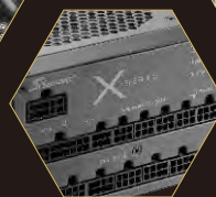
Patented DC connector Module