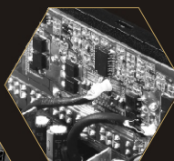
Patented DC connector Module