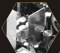
High Quality 105°C E-Cap